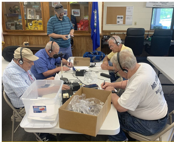
CW PRACTICE AT THE OEM

MARC August activity meeting TBD, 7pm Thursday Aug 22 on ZOOM only Zoom credentials for Activity Meeting 966 7099 0175 Password 157710