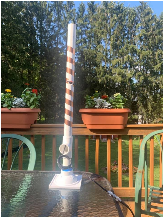
KC1KQH HOMEBREW TWO METER ANTENNA