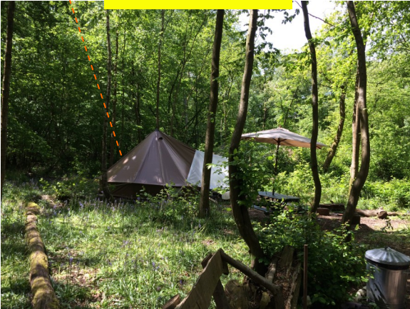
W1KKF CW TENT