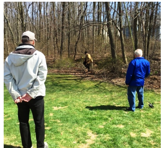
THE K1TDO ROCKET ANTENNA INSTALLATION CREW, W1KKF, WB1FYL, KC1ACN & K1TSO