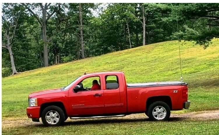
JOHN KC1KQH'S OPERATING POSITION