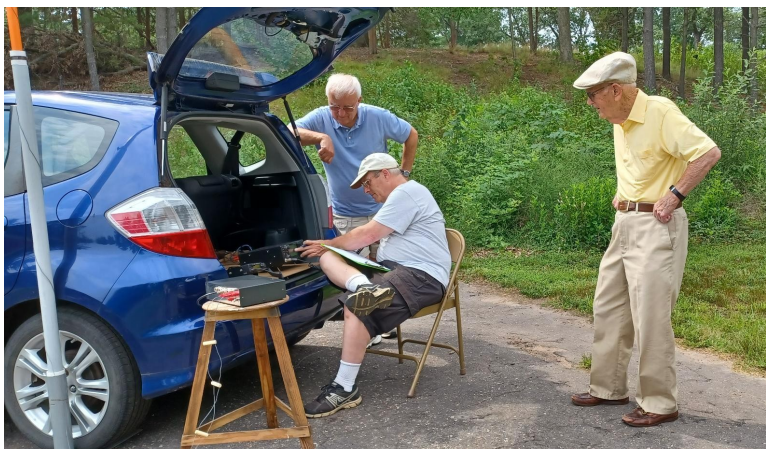
#K-1728 Wharton Brook State Park, KC1HDB, WA1ZVY, KB1JL, KE1AU, KE1AY were among the visitors. The activations were successful. Photo of NZ1J at the helm with KE1AU and KE1AY supervising.