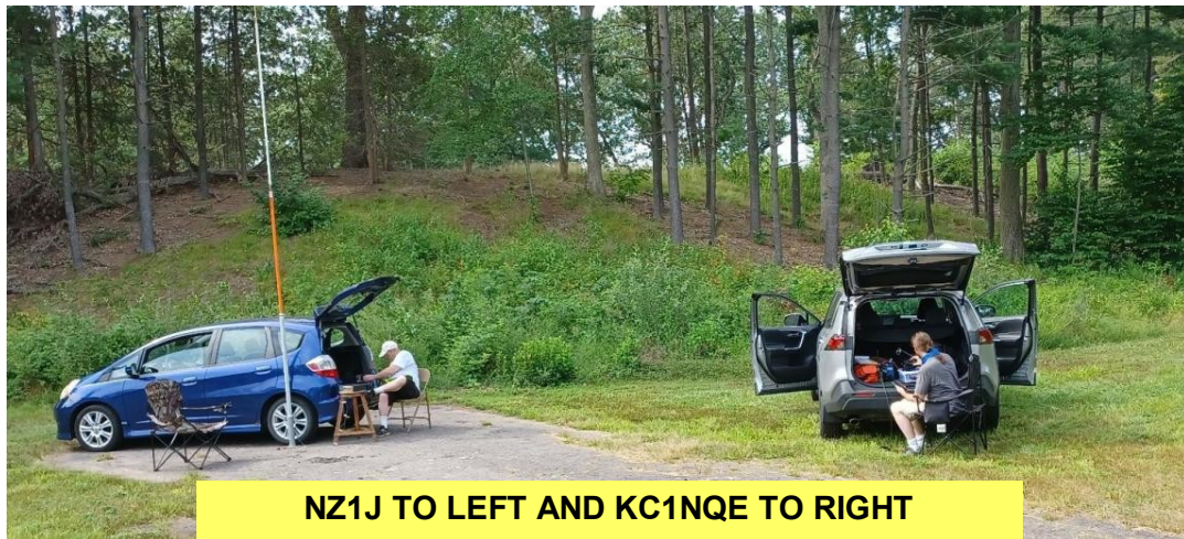
NZ1J TO LEFT AND KC1NQE TO RIGHT