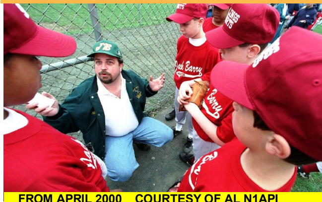
FROM APRIL 2000